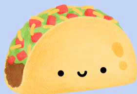
STEAK TACOS $8 TWO TACOS WITH SIDE OF WHITE RICE INCLUDES DRINK AND FRUIT