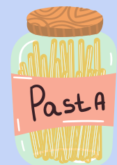
PASTA BOWL $8 PASTA (PLAIN OR WITH TOMATO SAUCE) SERVED WITH SIDE OF CHICKEN INCLUDES DRINK AND FRUIT